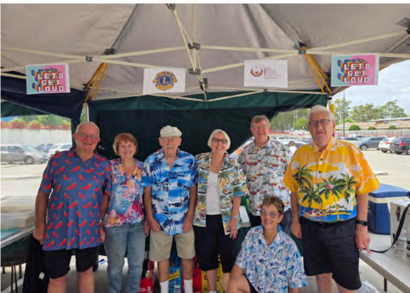
Tacking Point Lions