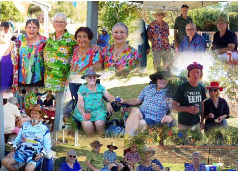
Armidale Dumaresq Lions