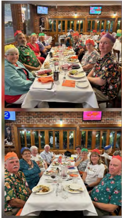
Left: Tamworth City Lions