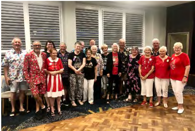
Bonville Sawtell Lions