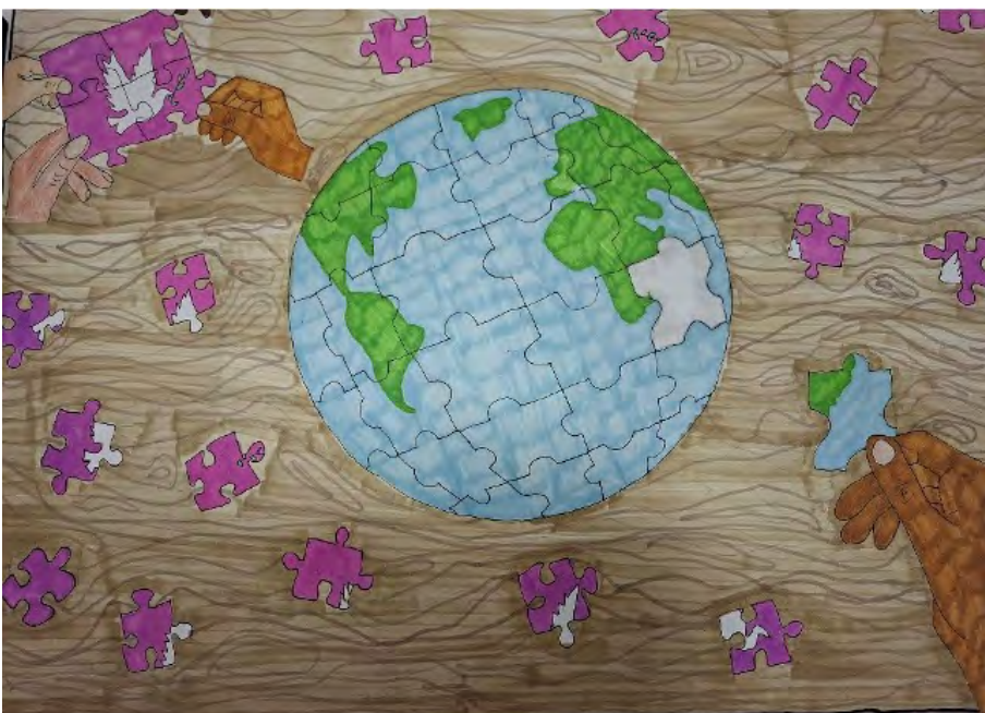
District 201n1 winner 2025

“My peace poster was inspired by the one I created last year, where I first imagined the world as a giant puzzle. This year, that idea has grown into a vision of unity and hope: people of every shape, size, and colour coming together to piece the world back into harmony. In my artwork, you’ll see hands carefully fitting puzzle pieces into place—some building the vibrant globe itself, while others gently connect the pieces of a dove, the timeless symbol of peace. All of this happens on a warm wooden table, a space that invites collaboration and shared dreams. Through this image, I hope to show that when we come together with kindness and understanding, we can create a world that’s whole, peaceful and full of promise.”